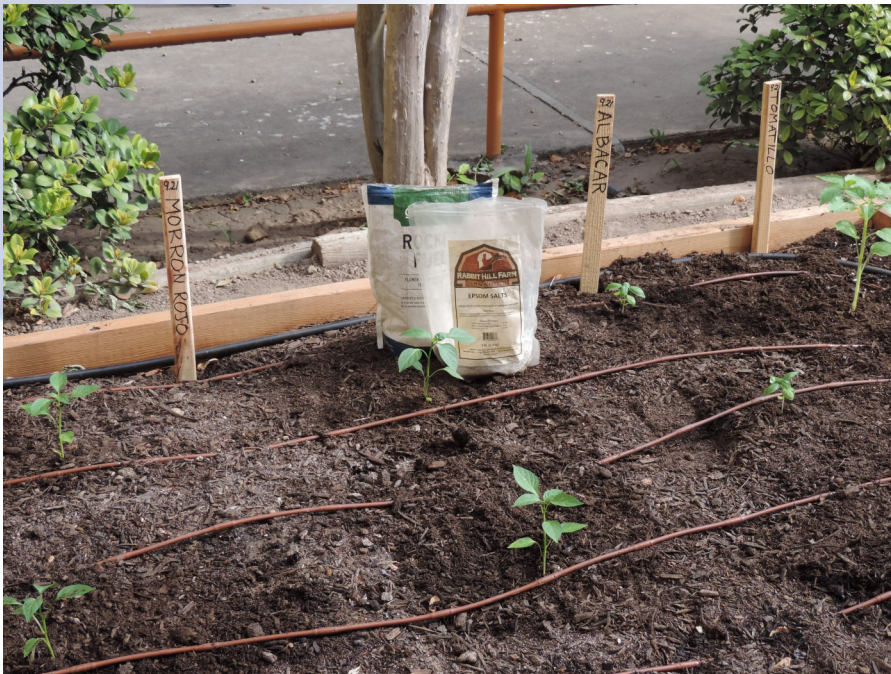
Garden beds now have posts with the description of what has been planted in the soil.