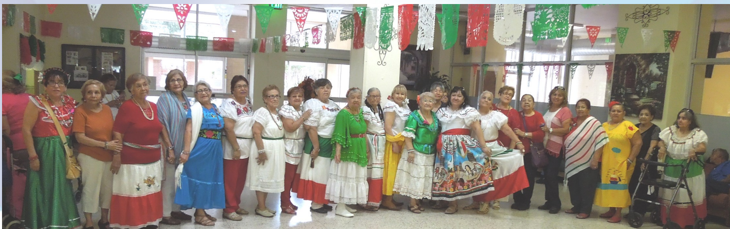
The ladies at Seniors show off their festive attire to celebrate 16 de septiembre.